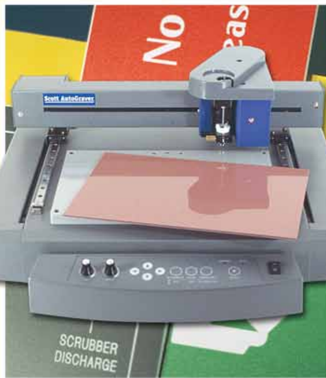
Scott AutoGraver® Engraving Machine